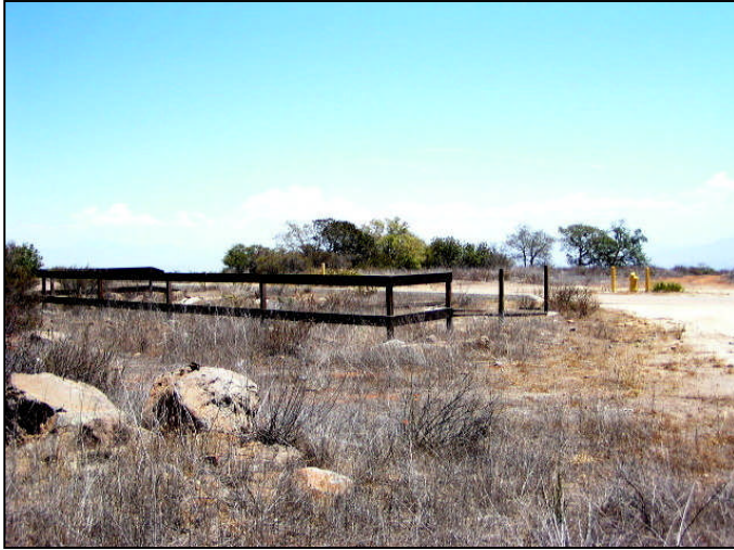
Photograph 5: View from Redondo Mesa candidate location, facing east.