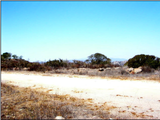
Photograph 3: View toward Redondo Mesa candidate location, facing northwest.