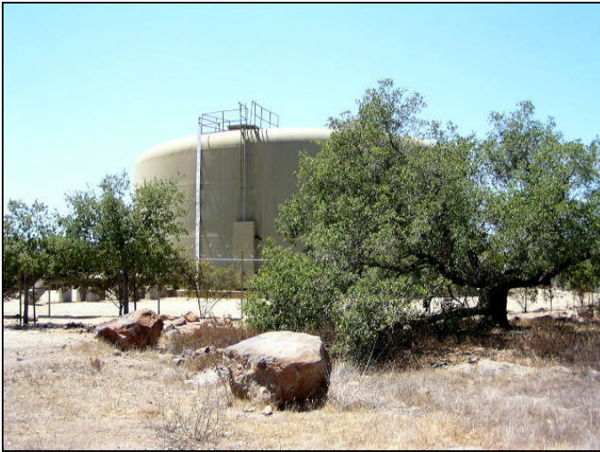
Photograph 7: View from Redondo Mesa candidate location, facing southwest.