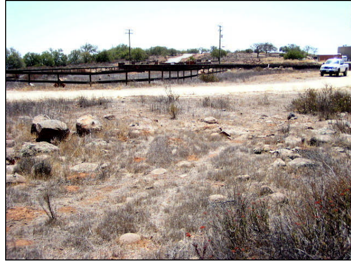
Photograph 2: View toward Redondo Mesa candidate location, facing south.