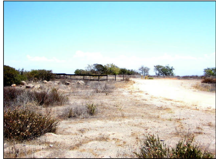
Photograph 4: View toward Redondo Mesa candidate location, facing east.