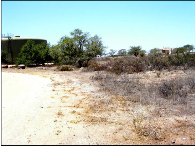
Photograph 1: View toward Redondo Mesa candidate location, facing west.