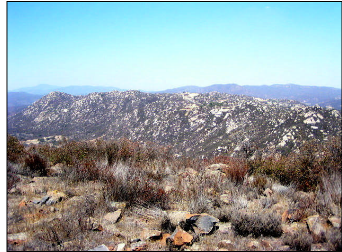
Photograph 8: View from Redondo Mesa candidate location, facing north.