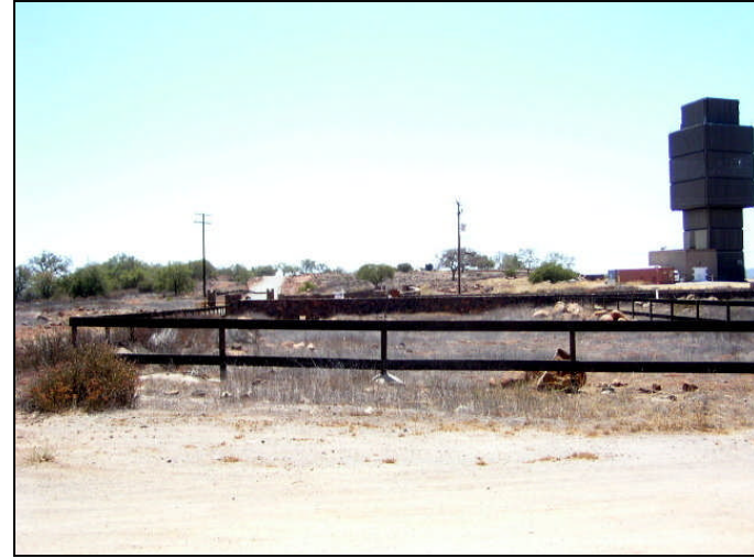
Photograph 6: View from Redondo Mesa candidate location, facing south.