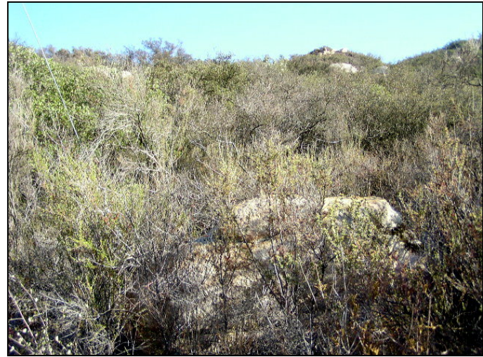
Photograph 6: View from Margarita SDSU candidate location, facing south.