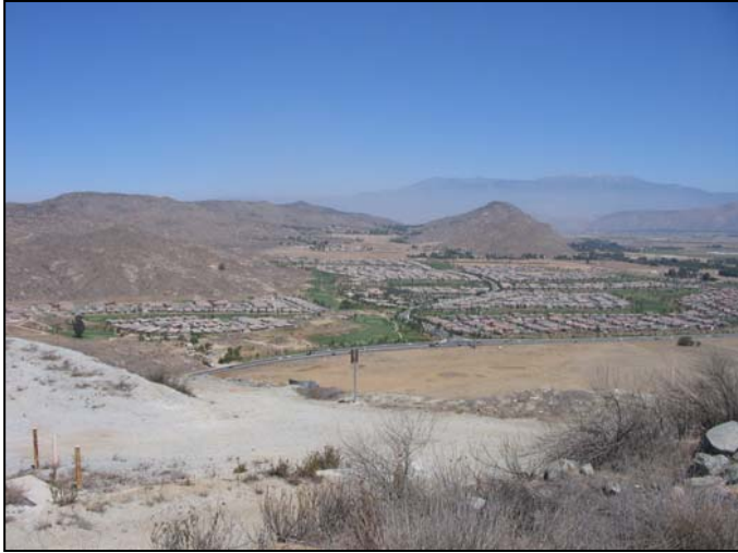
Photograph 5: View from Winchester candidate location, facing northeast.