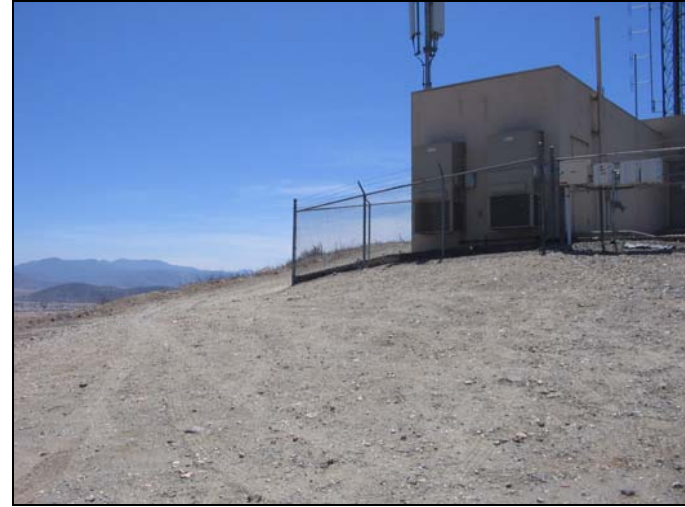
Photograph 6: View from Winchester candidate location, facing southeast.