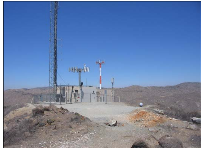
Photograph 4: Overview of Winchester candidate location, facing northwest.