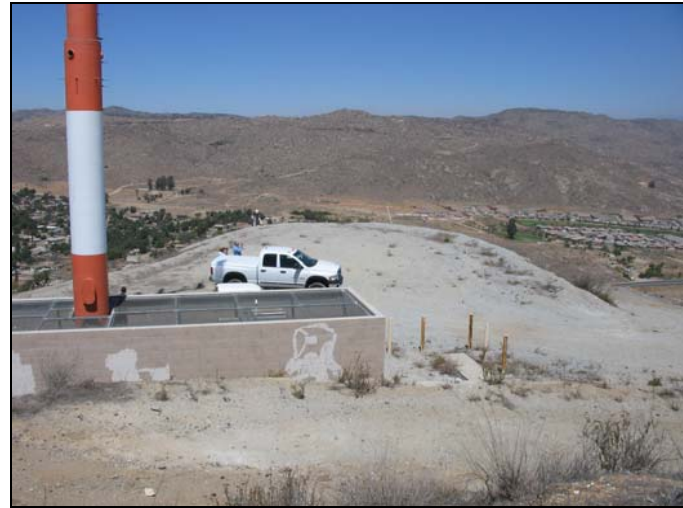
Photograph 2: View toward Winchester candidate location, facing north.