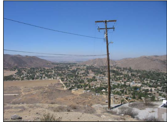
Photograph 8: View from Winchester candidate location, facing northwest.