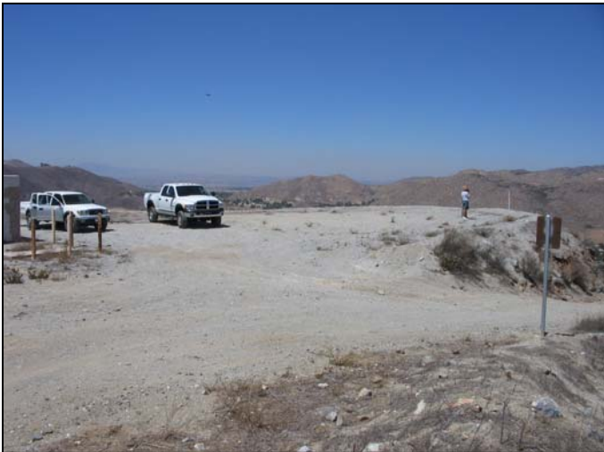
Photograph 3: View toward Winchester candidate location, facing northwest.