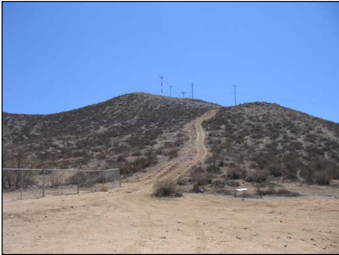
Photograph 1: Overview of Winchester candidate location, facing southeast.