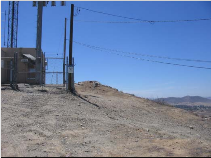
Photograph 7: View from Winchester candidate location, facing southwest.