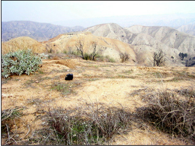
Photograph 1: View toward Timoteo candidate location, facing north.