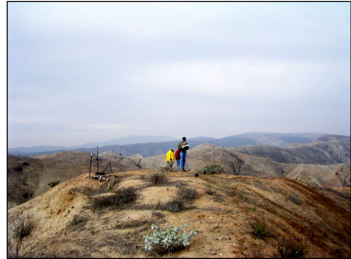
Photograph 4: View toward Timoteo candidate location, facing west.