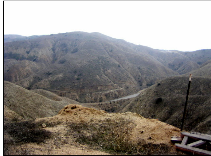
Photograph 6: View from Timoteo candidate location, facing southeast.