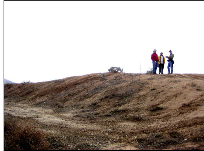
Photograph 2: View toward Timoteo candidate location, facing south.