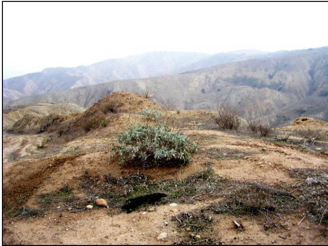
Photograph 3: View toward Timoteo candidate location, facing east.