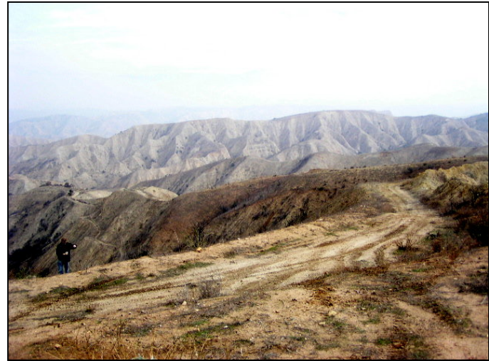
Photograph 8: View from Timoteo candidate location, facing northeast.