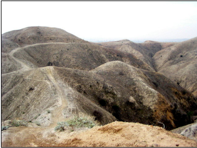
Photograph 5: View from Timoteo candidate location, facing south-southwest.