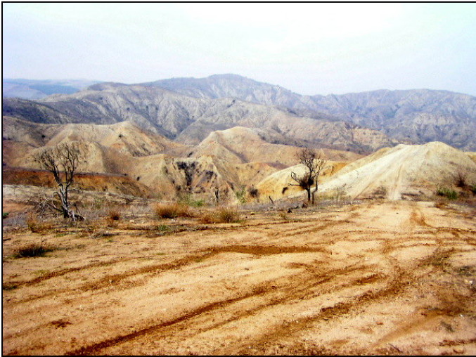
Photograph 7: View from Timoteo candidate location, facing northwest.