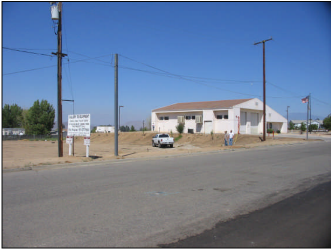
Photograph 1: View toward Menifee candidate location, facing northeast.