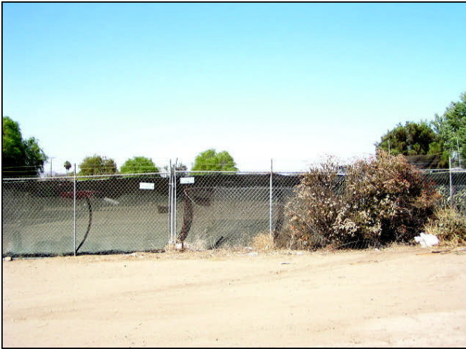
Photograph 7: View from Meniffee candidate location, facing north.