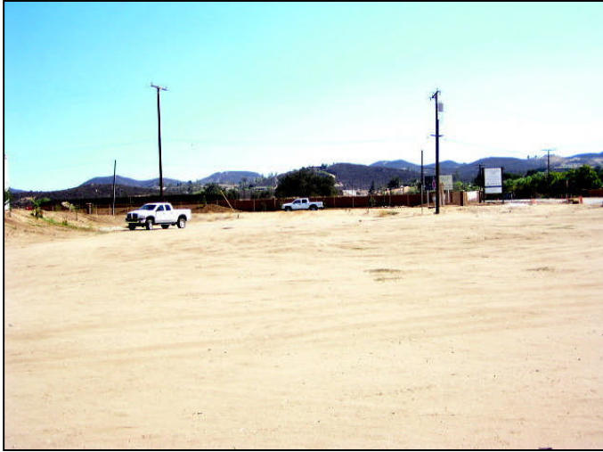
Photograph 5: View from Meniffee candidate location, facing south.