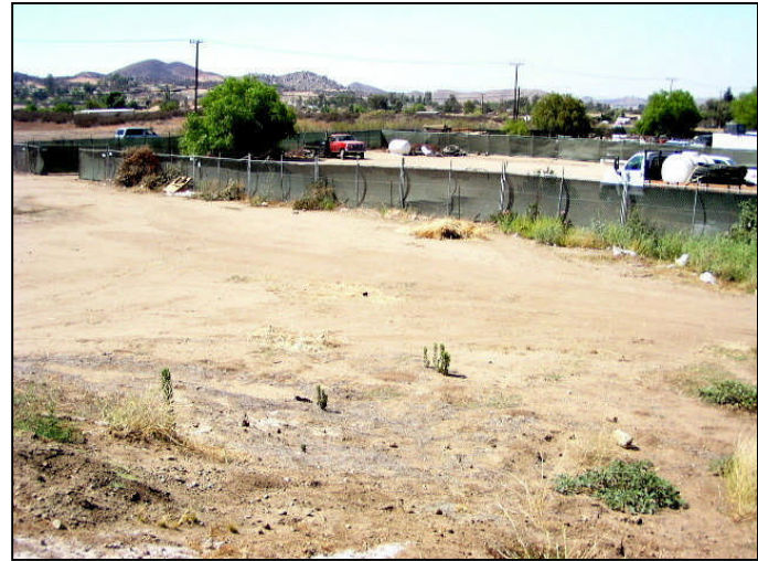
Photograph 4: View toward Menifee candidate location, facing northwest.