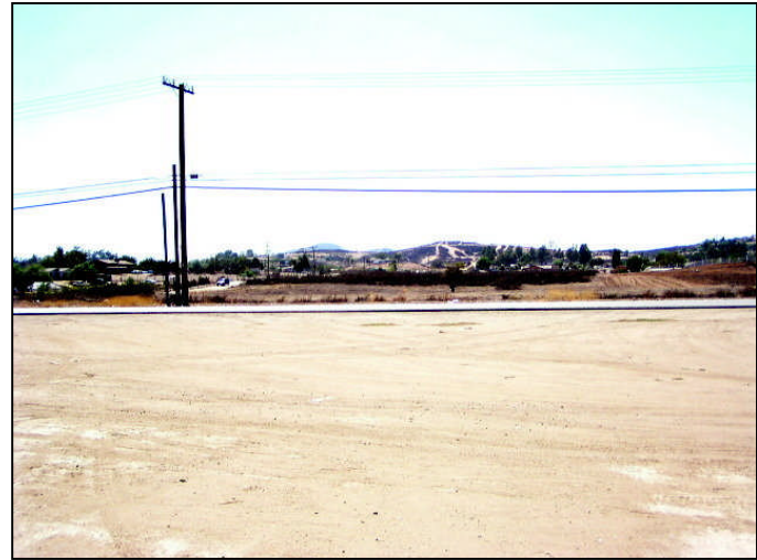
Photograph 8: View from Meniffee candidate location, facing west.