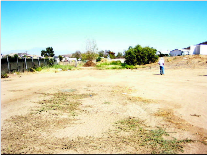
Photograph 3: View toward Menifee candidate location, facing east.