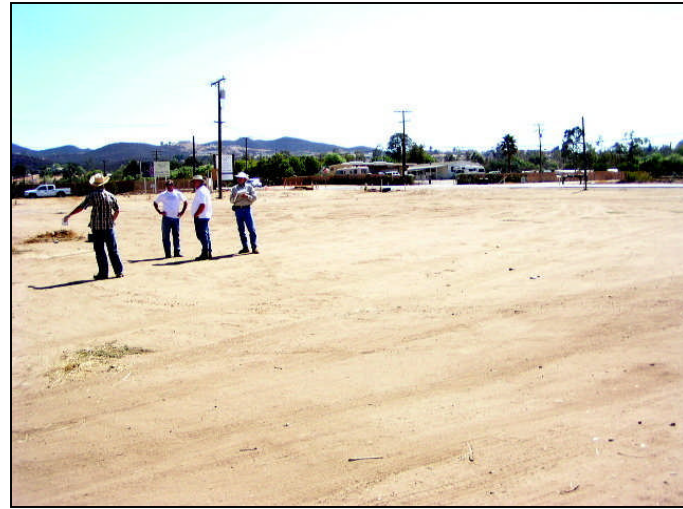
Photograph 2: View toward Menifee candidate location, facing southwest.