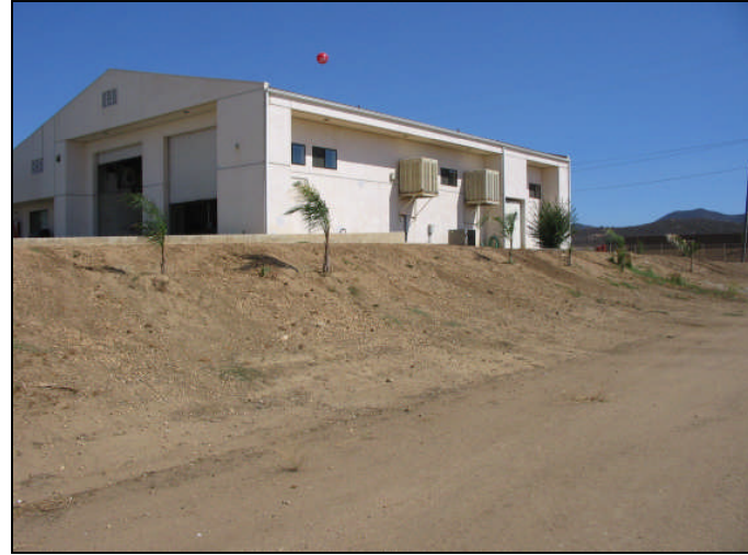
Photograph 6: View from Meniffee candidate location, facing southeast.