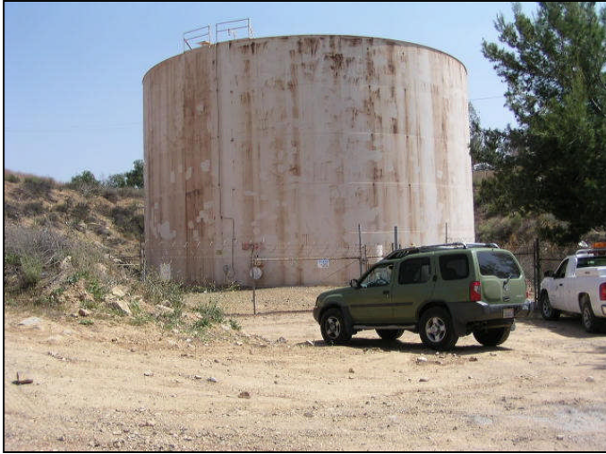
Photograph 1: Overview of Marshall candidate location, facing southeast.