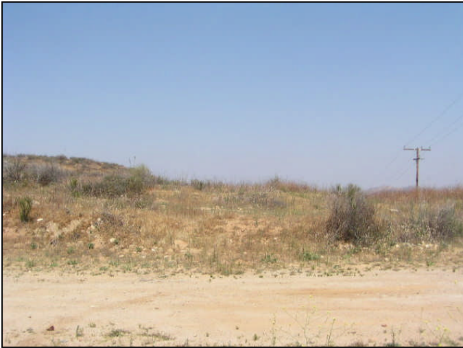
Photograph 7: View from Marshall candidate location, facing northeast.