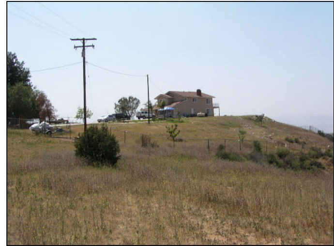
Photograph 8: View from Marshall candidate location, facing west.