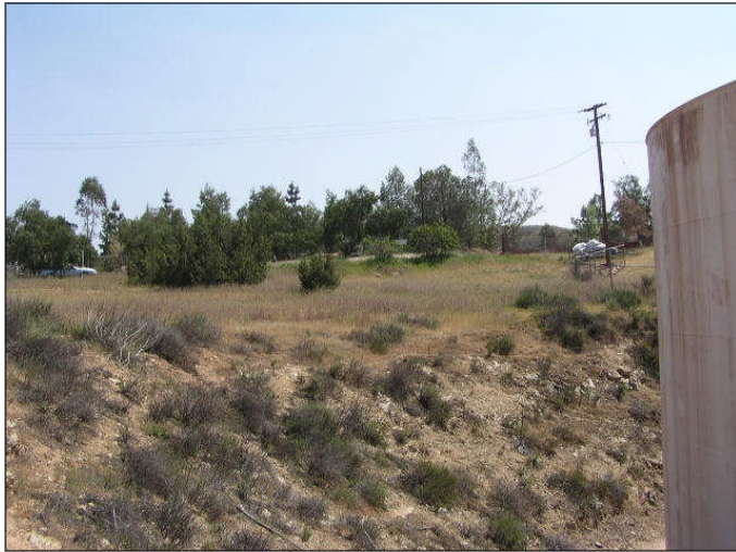
Photograph 3: View toward Marshall candidate location, facing southwest.