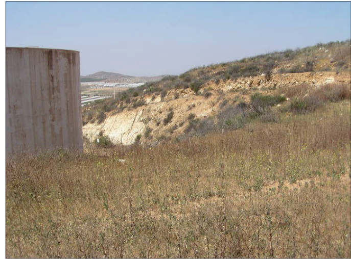
Photograph 4: View toward Marshall candidate location, facing north.

Source: Michael Brandman Associates, 2008.