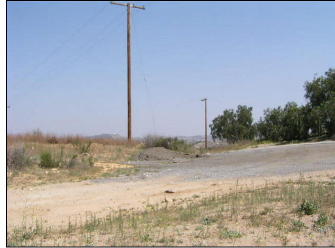
Photograph 6: View from Marshall candidate location, facing southeast.