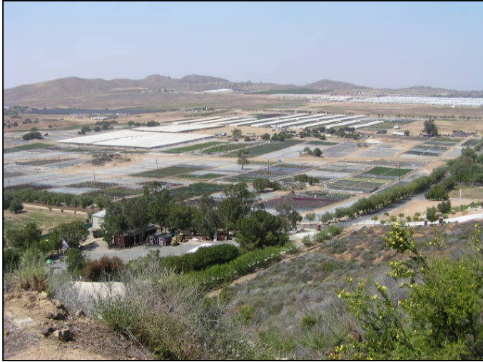
Photograph 5: View from Marshall candidate location, facing north.