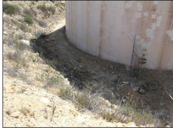
Photograph 2: View toward Marshall candidate location, facing towards the ground surface.