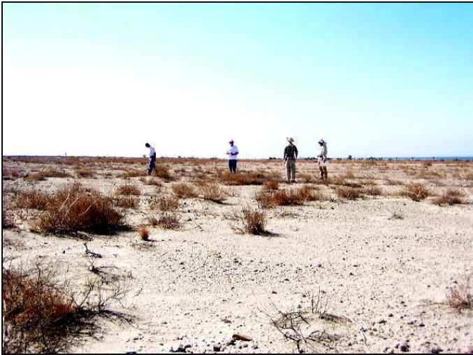
Photograph 3: View toward Line candidate location, facing southeast.