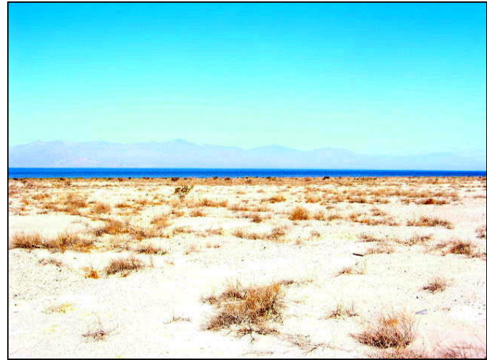
Photograph 8: View from Line candidate location, facing west.