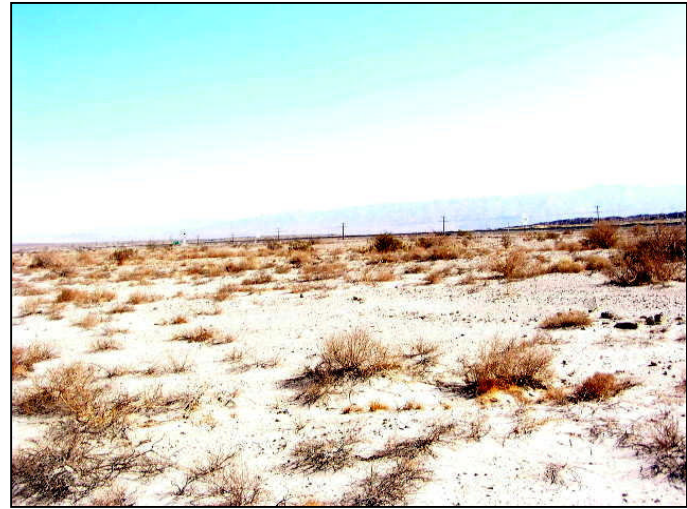
Photograph 6: View from Line candidate location, facing north.