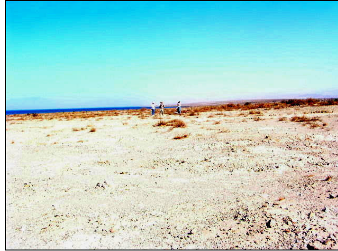
Photograph 2: Overview of Line candidate location, facing northwest.