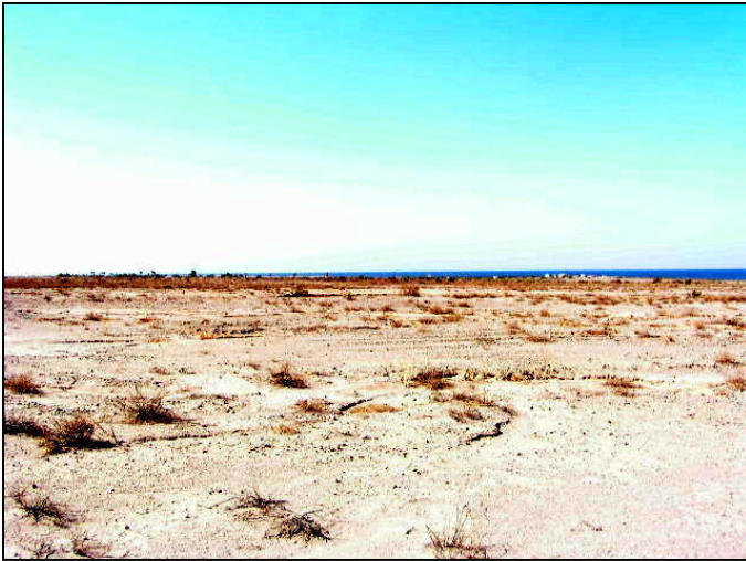
Photograph 7: View from Line candidate location, facing south.