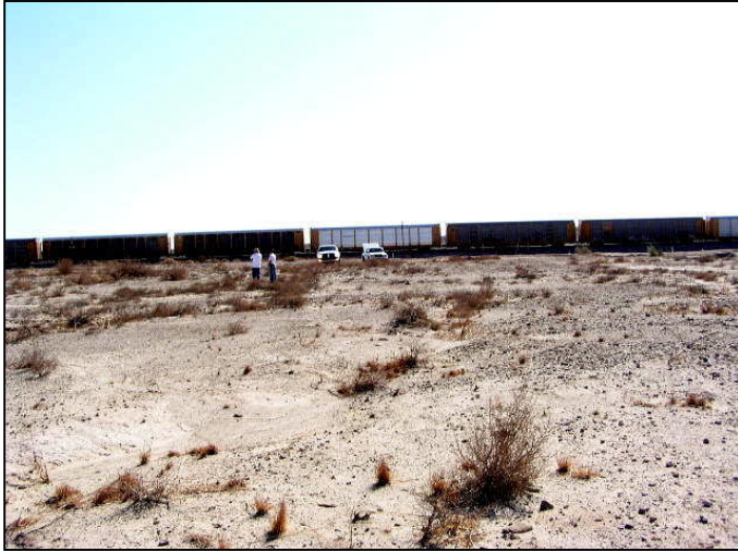
Photograph 1: View toward Line candidate location, facing northeast.