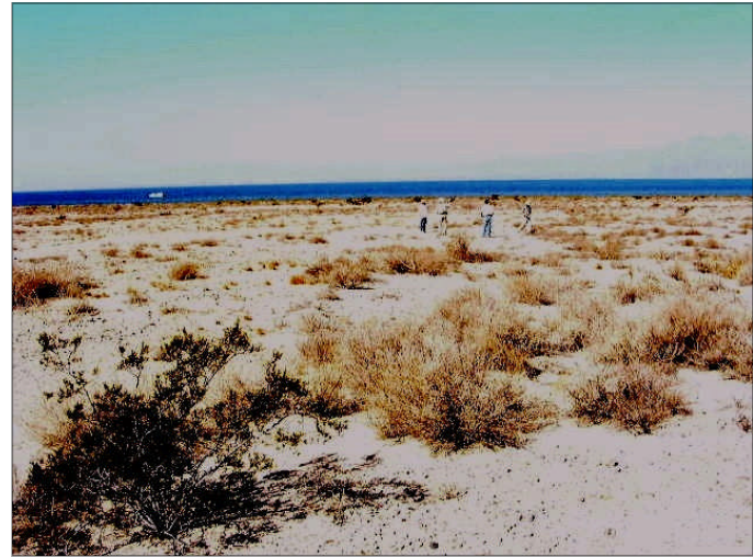
Photograph 4: View toward Line candidate location, facing southwest.