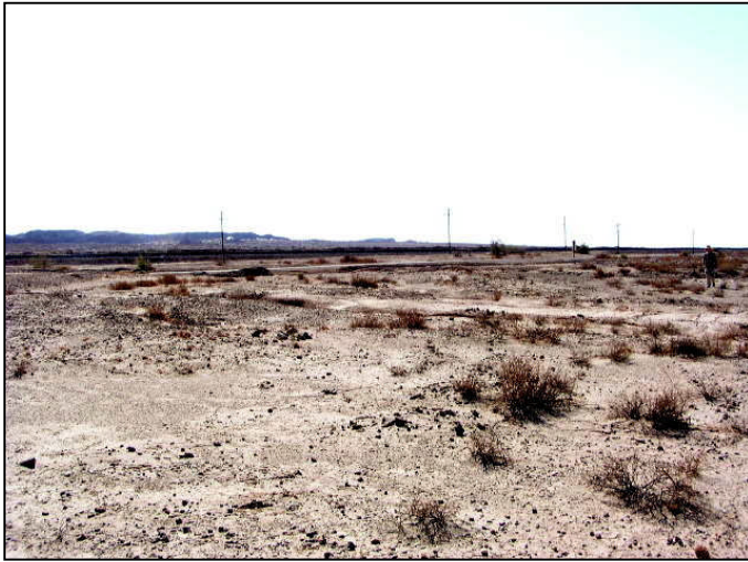
Photograph 5: View from Line candidate location, facing east.