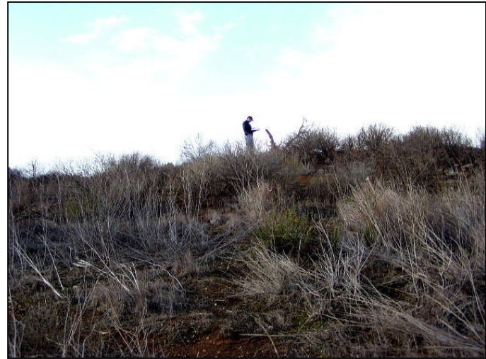
Photograph 4: View toward Leona candidate location, facing southwest.