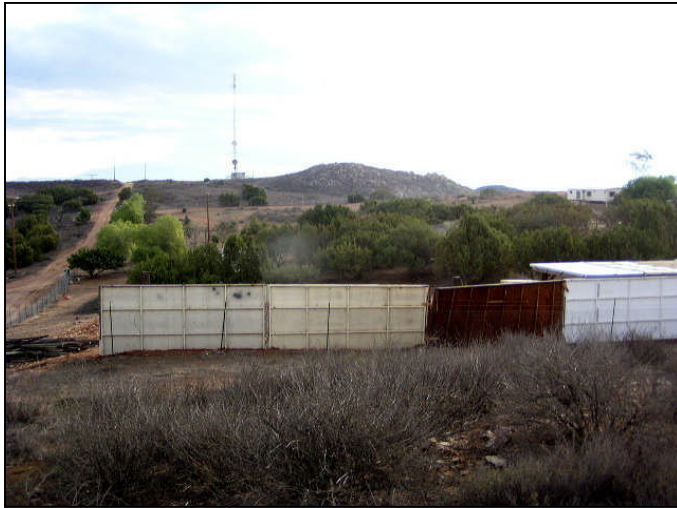
Photograph 7: View from Leona candidate location, facing east.