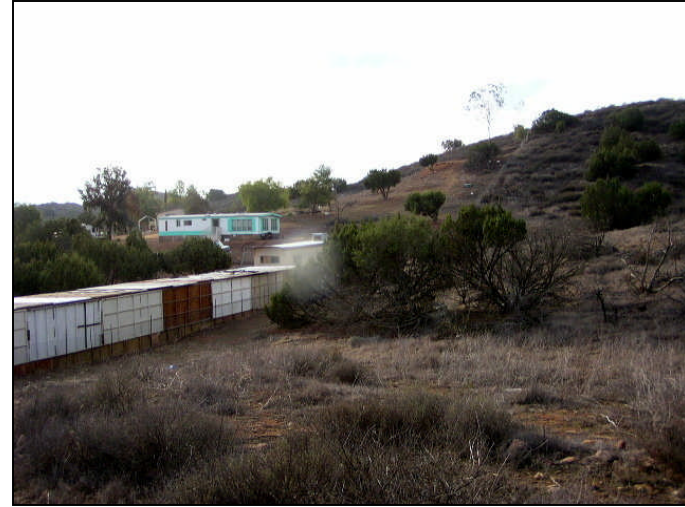
Photograph 6: View from Leona candidate location, facing south.