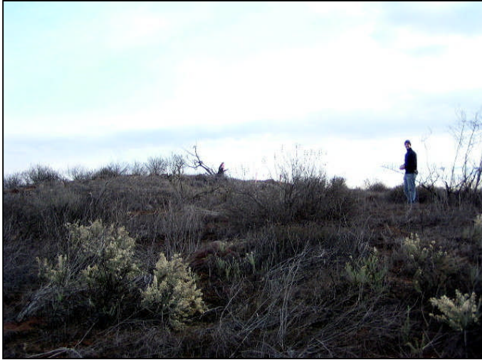
Photograph 1: View toward Leona candidate location, facing northeast.