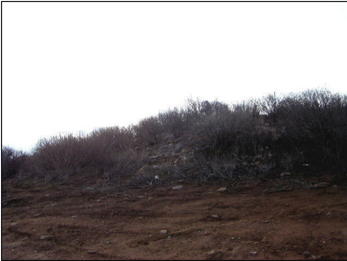
Photograph 3: View toward Leona candidate location, facing southeast.