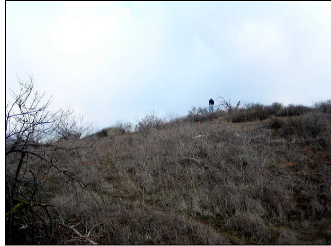
Photograph 2: View toward Leona candidate location, facing northwest.