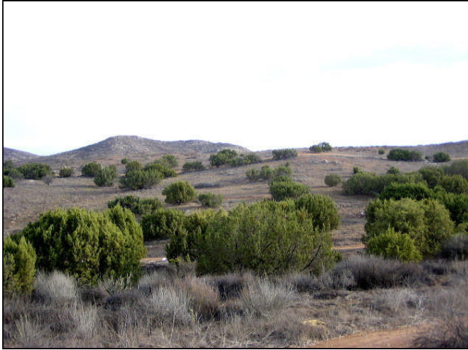
Photograph 5: View from Leona candidate location, facing northeast.