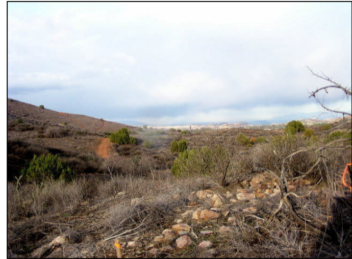
Photograph 8: View from Leona candidate location, facing west.