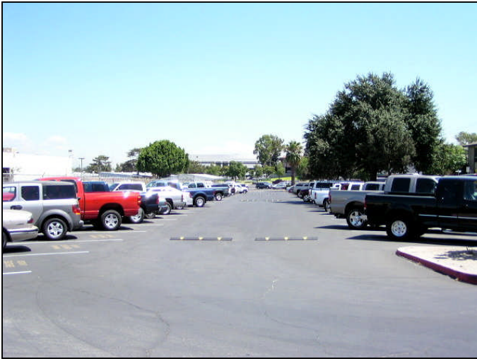
Photograph 7: View from Corona candidate location, facing east.