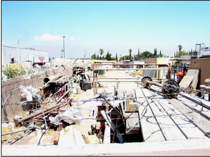
Photograph 1: View toward Corona candidate location, facing north.