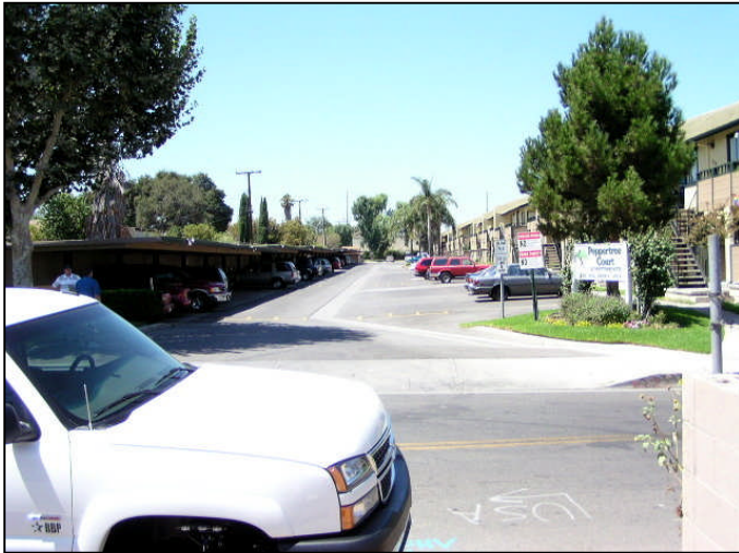
Photograph 5: View from Corona candidate location, facing west.