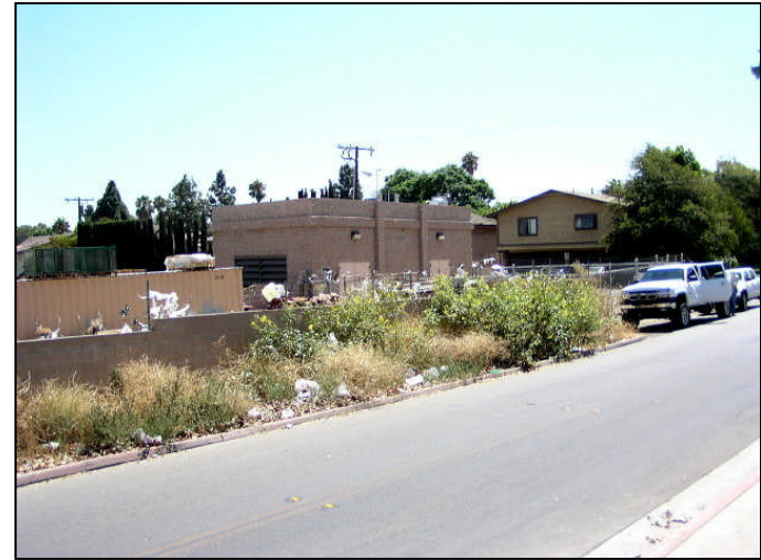
Photograph 4: View toward Corona candidate location, facing southeast.