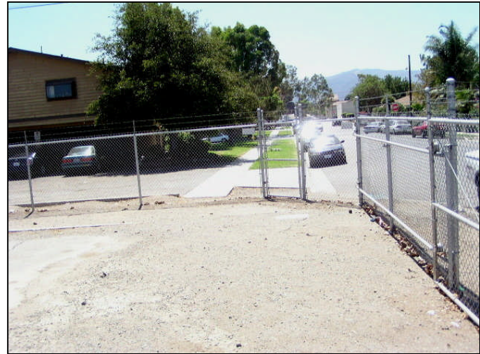
Photograph 6: View from Corona candidate location, facing south.