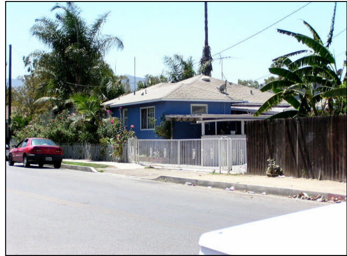
Photograph 8: View from Corona candidate location, facing southwest.