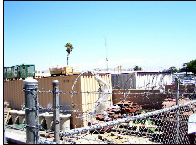
Photograph 2: View toward Corona candidate location, facing northeast.