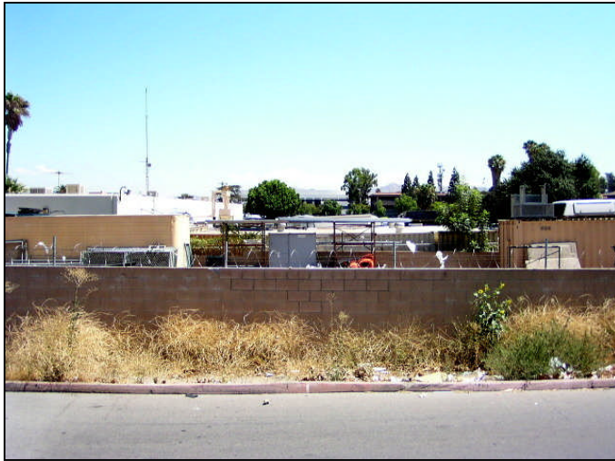
Photograph 3: View toward Corona candidate location, facing east.