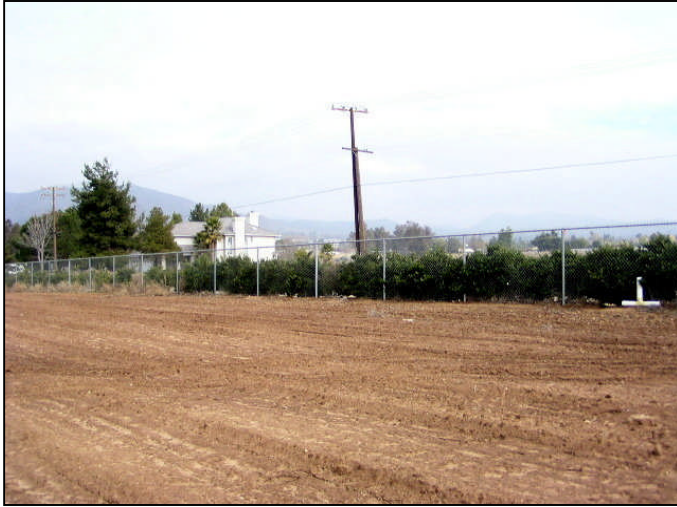
Photograph 5: View from Brookside candidate location, facing northeast.