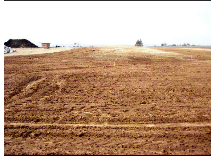
Photograph 2: View toward Brookside candidate location, facing west.