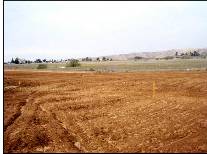
Photograph 6: View from Brookside candidate location, facing northwest.