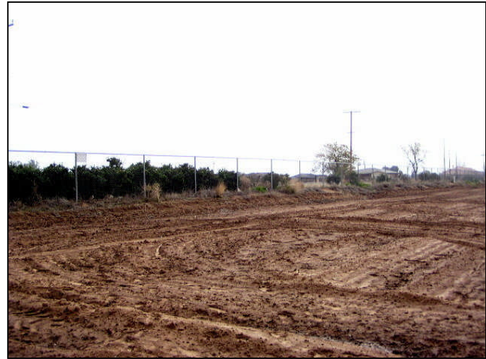
Photograph 8: View from Brookside candidate location, facing southeast.