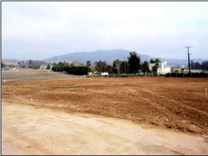
Photograph 3: View toward Brookside candidate location, facing northwest.