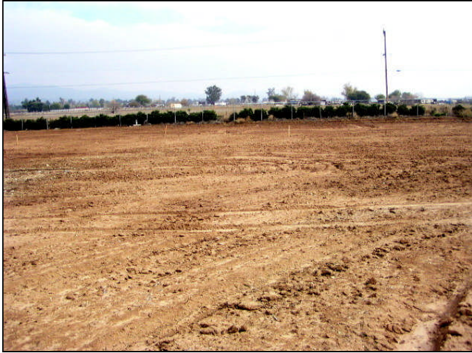
Photograph 1: View toward Brookside candidate location, facing east.