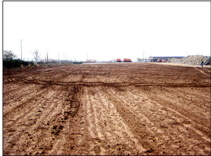
Photograph 4: View toward Brookside candidate location, facing south.