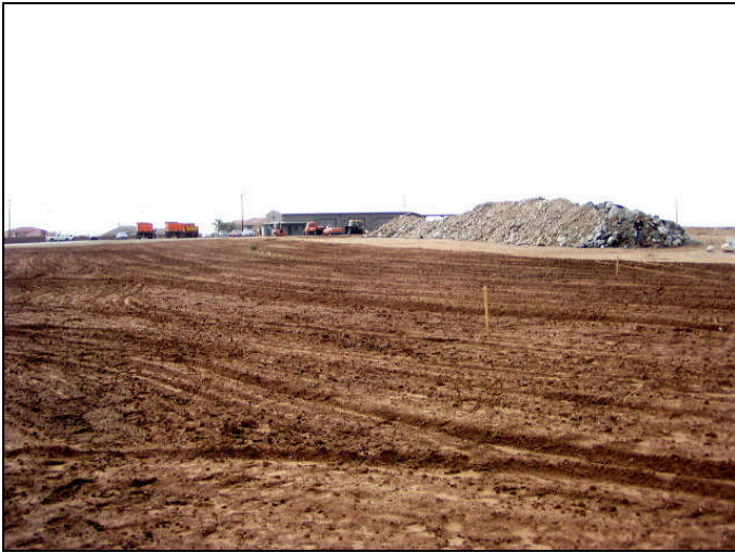
Photograph 7: View from Brookside candidate location, facing southwest.